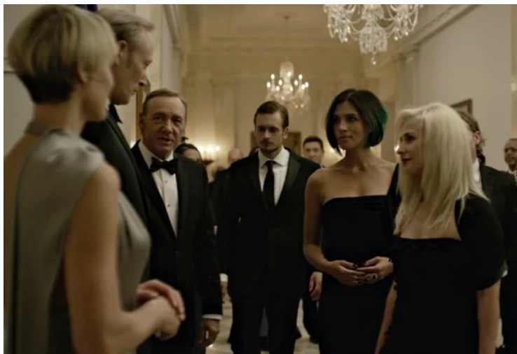
Screenshot of House of Cards .

Besides acting as a magnet for well-known international artists, INSTAR is also designed, Bruguera says, to serve a basic pedagogical function. “It will be a real-life school for useful art, a place where artists and activists can both learn and teach the ABCs of civics,” declares the Hugo Boss Prize-shortlisted artist who is also the first artist in residence for Mayor Bill de Blasio’s Office of Immigrant Affairs. “What keeps me up at night is not what’s happening today in Cuba, but what may happen tomorrow, unless people learn about and recognize their rights as citizens.”