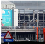
( https://news.artnet.com/market/brussels-attack-lockdown-museums-closed-455615 )

By Henri Neuendorf ( https://news.artnet.com/about/henri-neuendorf-205 ), Mar 30, 2016