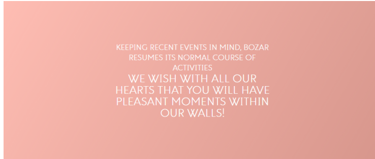
Bozar Museum Brussels.