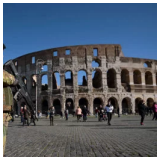
( https://news.artnet.com/art-world/italy-announces-protection-plan-462554 )

Art and Law ( https://news.artnet.com/art-world/art-law )